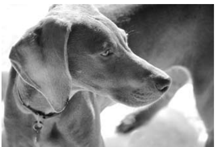
In addition to their silver coats, Weimaraners are known for a rare tremor disorder reported widely throughout North America and Europe.

Weimaraners—sleek, athletic dogs originally bred for hunting—are known for their striking, silver-tinged coats. Unfortunately, they also are known for a rare tremor disorder reported widely throughout North America and Europe.